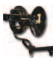
High-pressure turbo nozzles for faster cleaning

360° Pivot and non-pivot hose reels keep hose neatly stored and shop areas safe